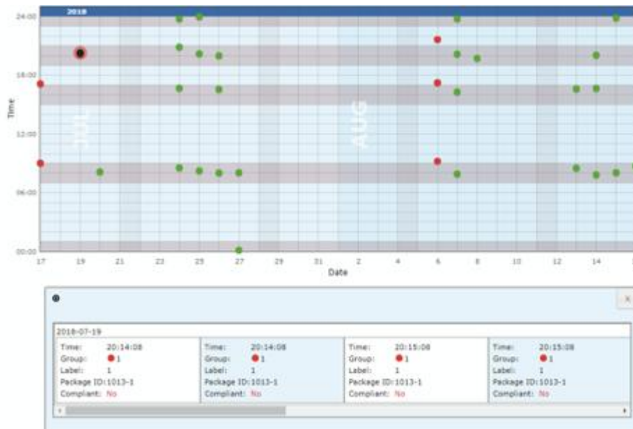
Fig 1: Clinical Investigator Dashboard showing mishandling of package (40% of patients were found to de-blister medications)

Med-ic is unique among adherence tools in enabling the targeting of non adherent patients to address patient-specific behaviour, rather than a simple broad-stroke approach.